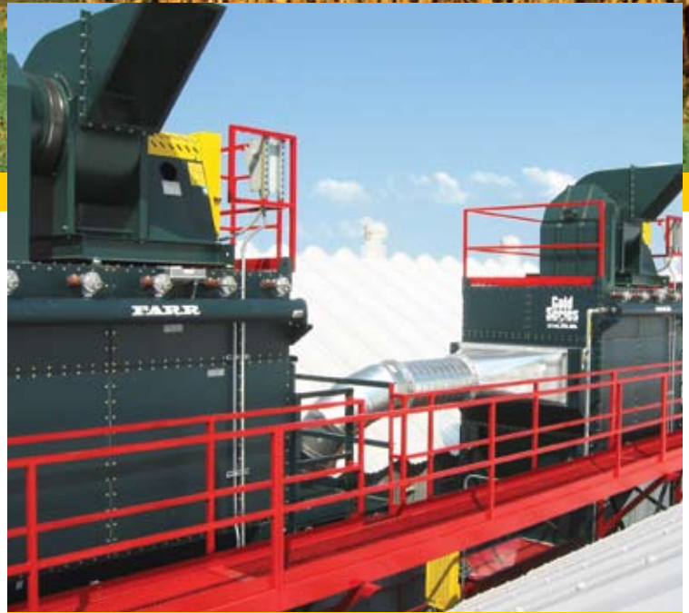
Two GS20's on Seed Cleaning

The Gold Series® dust collector can be used in a variety of Agricultural Seed Processing dust collection applications such as corn shellers, seed cleaning, seed preparation, seed coating, seed hybrid development and general facility ventilation. The vertical cartridge design works better and Farr APC is one of the few companies that can handle seed processing well.