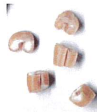
Wheat, finely cut