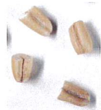
Oats, coarsely cut