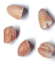
Wheat, coarsely cut